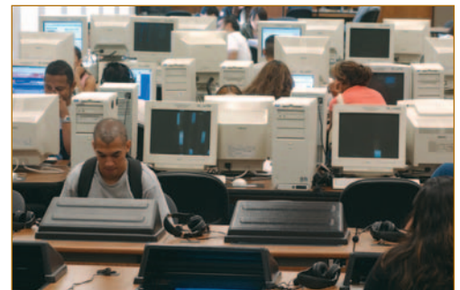
With high use, the college's Nealley Library received a much-needed renovation that included new carpeting, paint and furniture.