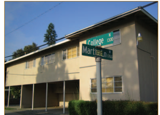
Properties located along College Avenue between 17th and Washington Streets were purchased with local bond revenues for campus expansion.

Architectural plans for the public safety institute, also known as the sheriffs training academy, were developed in collaboration with the Orange County Sheriffs Department.