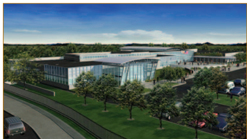
The planned Sheriffs Training Academy will be located on 15 acres the college district owns at the former Marine Corps Air Station in Tustin.

“ In May, the college celebrated Nealley Library's first phase of renovation... ”