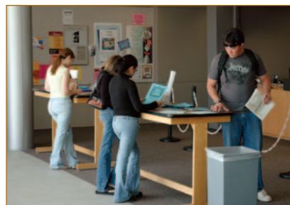
Opened just before fall semester 2004, the Student Services and Classroom Building is the first new building on Santiago Canyon College's campus in a decade. Among the support services students access in the new building are admissions and records, financial aid, the cashier, and a testing center.