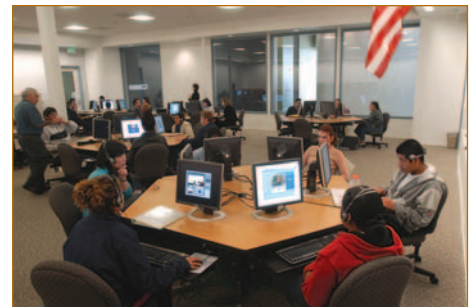
In transforming a microchip plant into its Orange Education Center, the college district created spaces that foster learning. Today, more than 10,000 students are enrolled in courses that lead to better employment opportunities as well as to college credit programs.