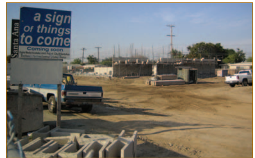
Designed to stimulate entrepreneurial technology ventures, the digital media center was started at the corner of Wilshire and S. Bristol in Santa Ana.