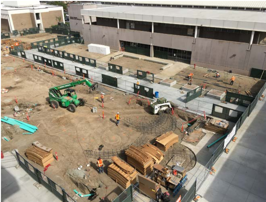
Phase 3 hardscape