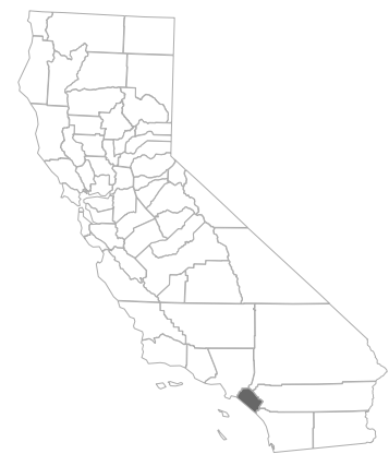
Orange County, California

Santa Ana College (SAC) creates a significant positive impact on the business community and generates a return on investment to its major stakeholder groups—students, taxpayers, and society. Using a two-pronged approach that involves an economic impact analysis and an investment analysis, this study calculates the benefits received by each of these groups. Results of the analysis reflect fiscal year (FY) 2020-21.