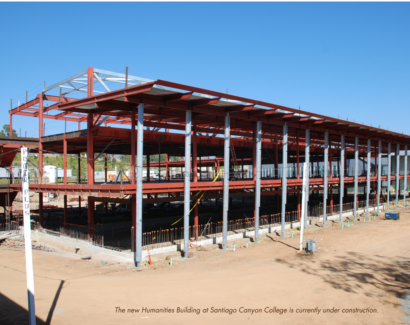
The new Humanities Building at Santiago Canyon College is currently under construction.