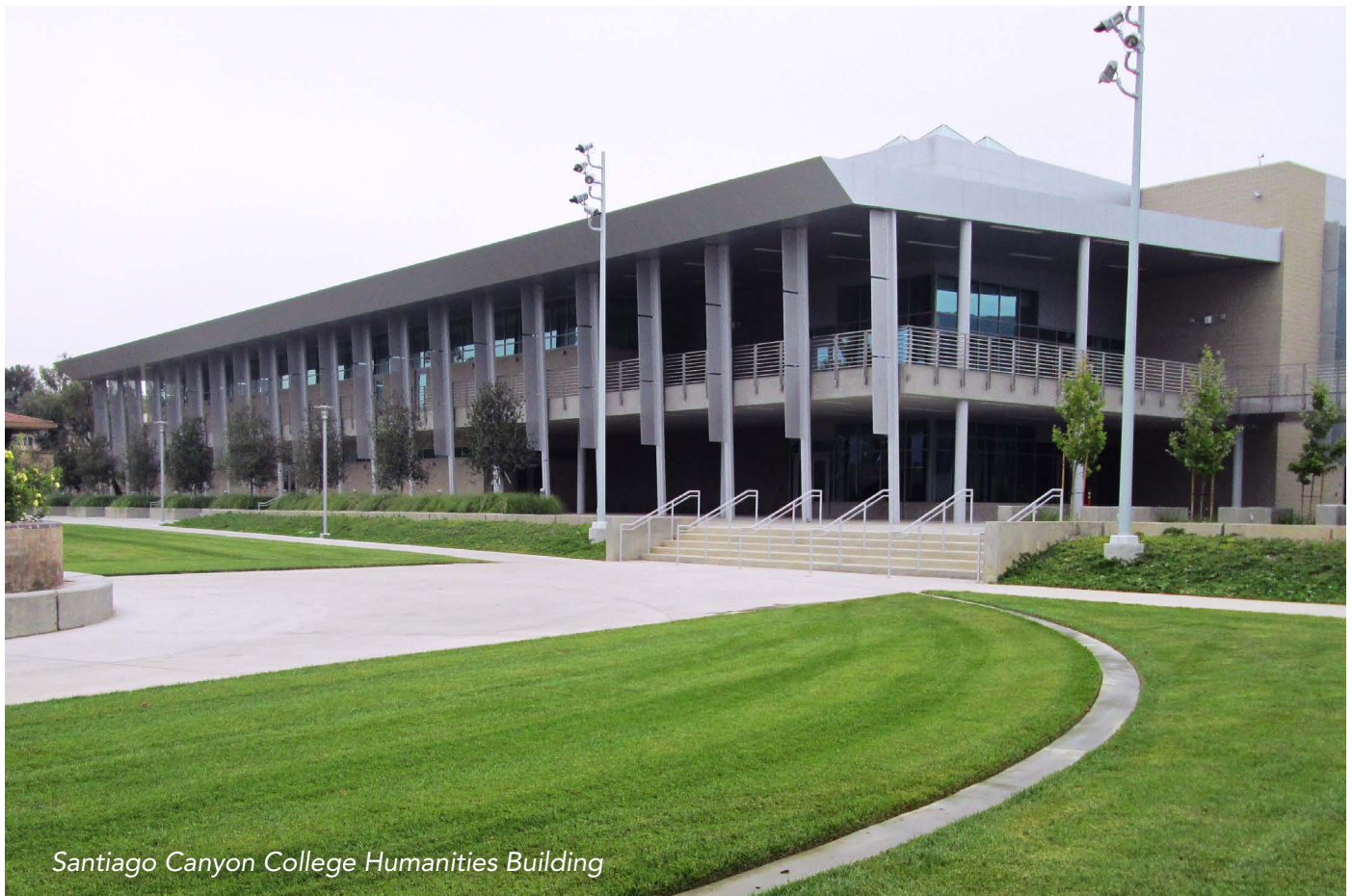
Santiago Canyon College Humanities Building

Work on a new campus entrance, including a new traffic signal from Chapman Ave. near Santiago Canyon Rd., is complete.