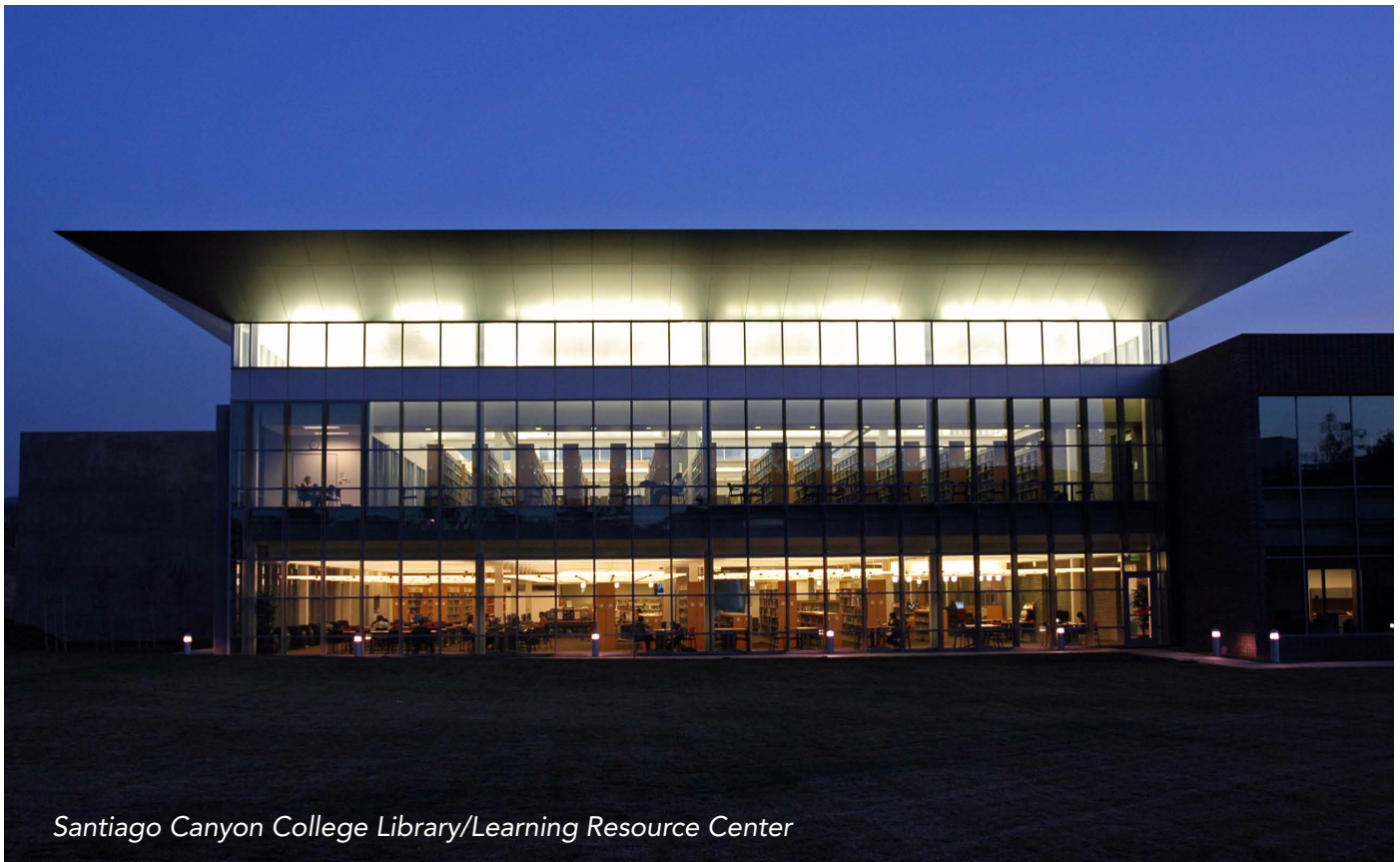
Santiago Canyon College Library/Learning Resource Center