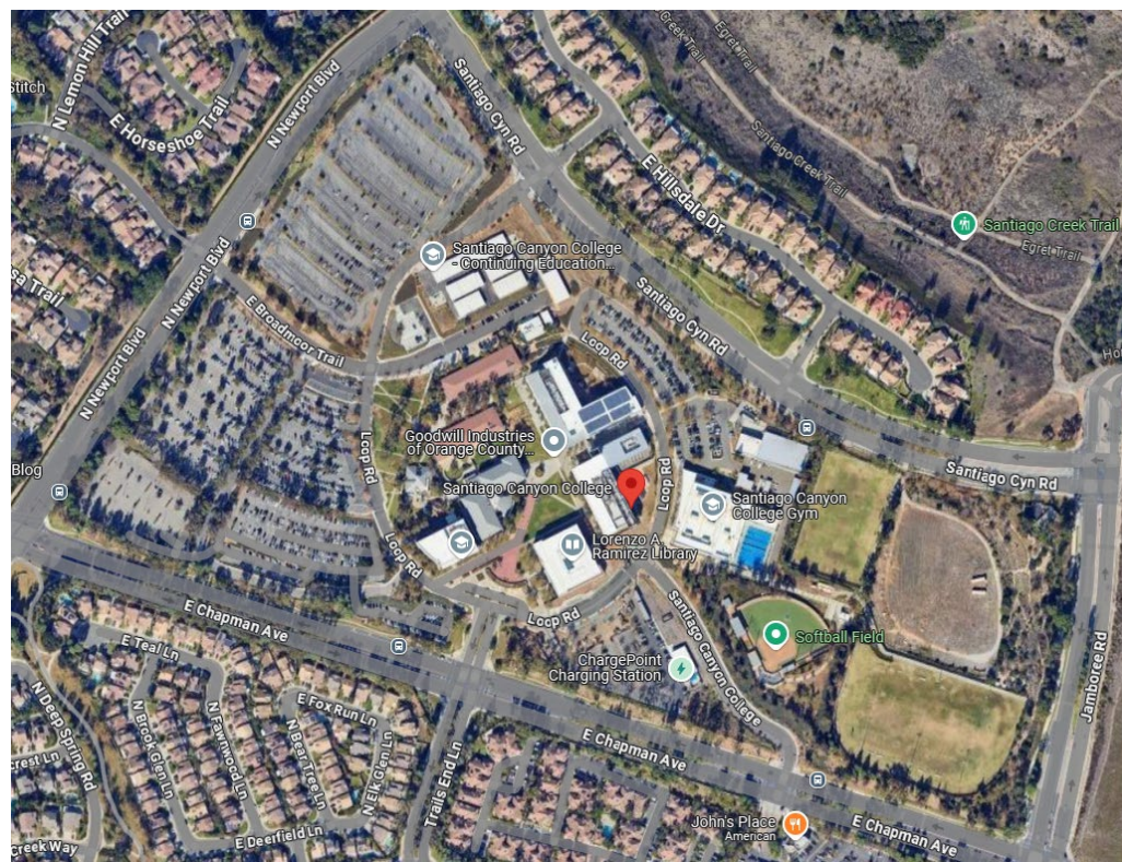
Santiago Canyon College (SCC) Map