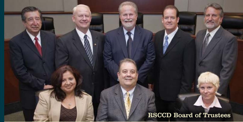
RSCCD Board of Trustees