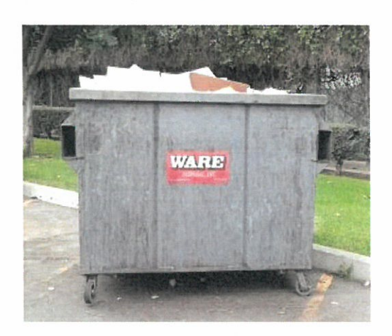
Over Filled + Extra Debris