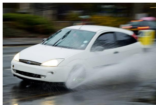
"Road Rage!" by Paul Carsola is licensed under CC BY-NC-SA 2.0